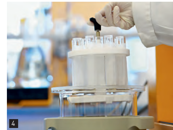
The removable handle makes it easier to insert and remove the sample carousel.