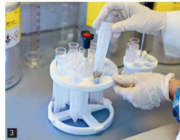
When the FibreBags are inserted into the sample carousel, they are automatically clamped firmly in place.