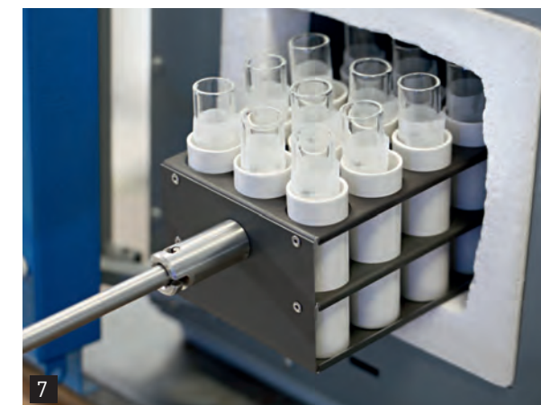
The incinerating module with a long handle makes handling of samples easier.