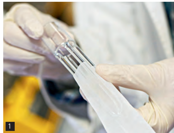
Easy handling: Insert FibreBag, weigh sample and you're ready. No need to seal the filter bag.