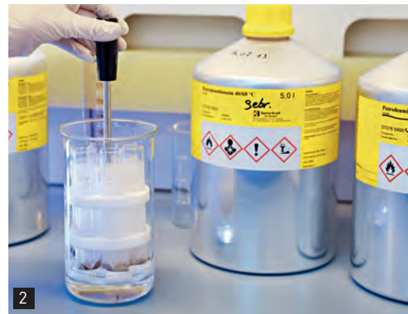
Convenient, time-saving degreasing with solvents in the degreasing module. 6 samples can be treated at the same time.