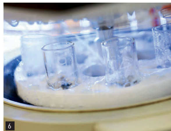
The rotating sample carousel ensures optimum bathing of the sample. The rotation is generated by the jet of detergent.